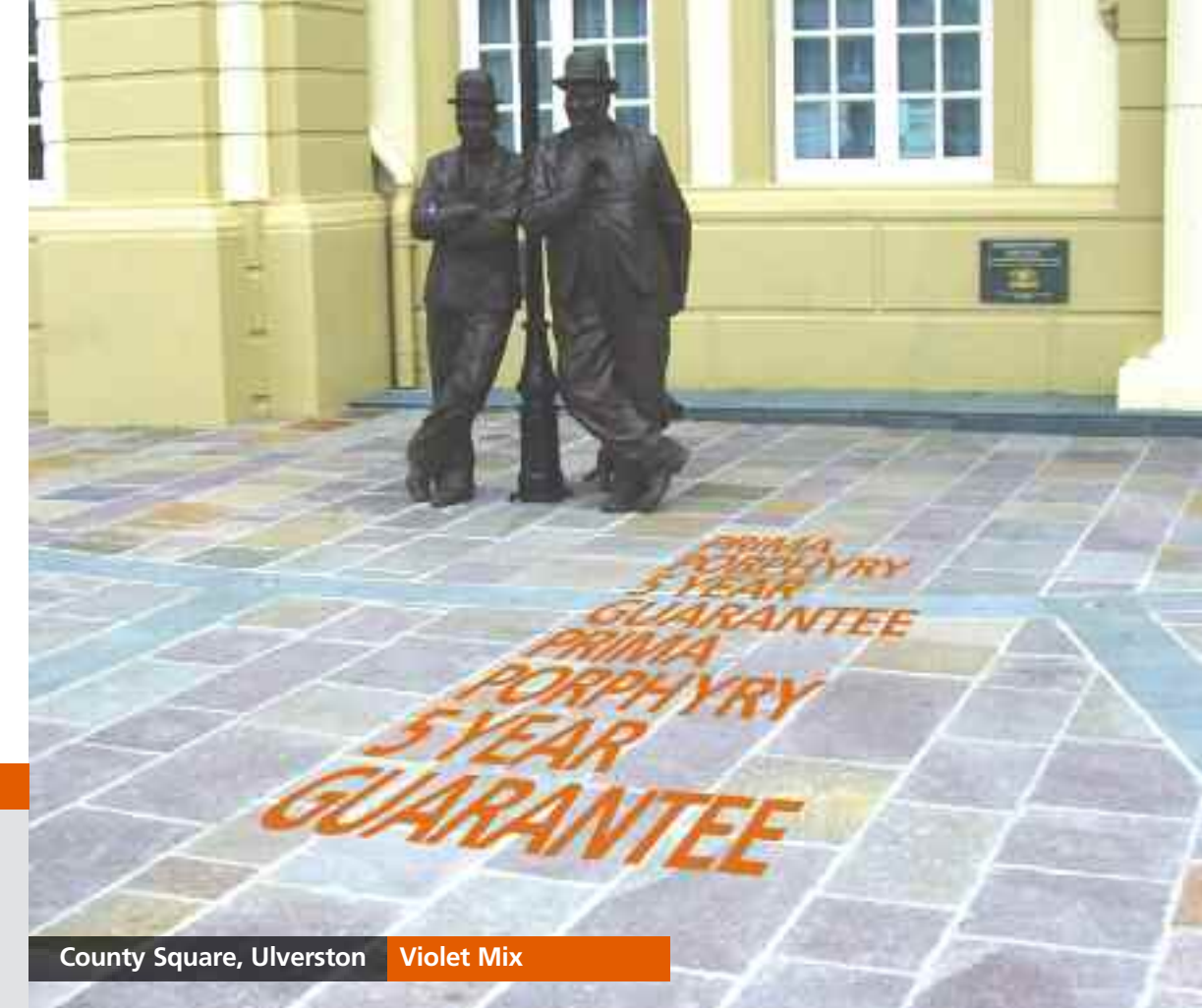
County Square, Ulverston Violet Mix

Specific bespoke items can be created on request such as tactiles, kerbs and street furniture.