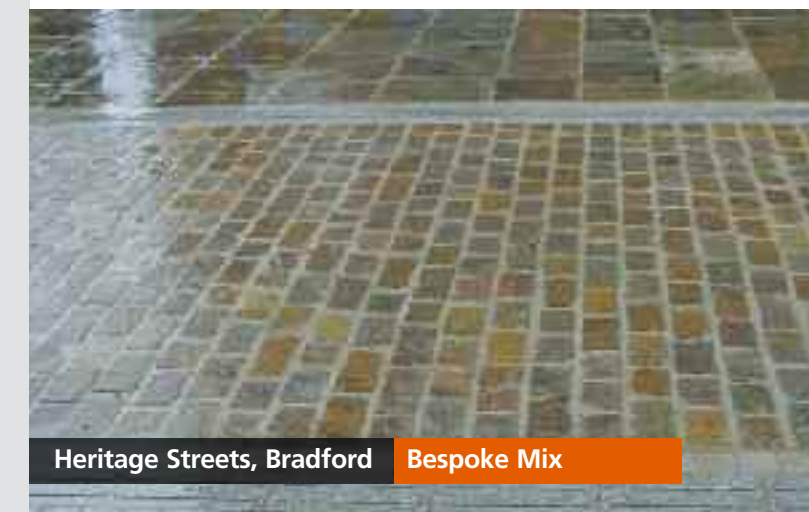
Heritage Streets, Bradford Bespoke Mix