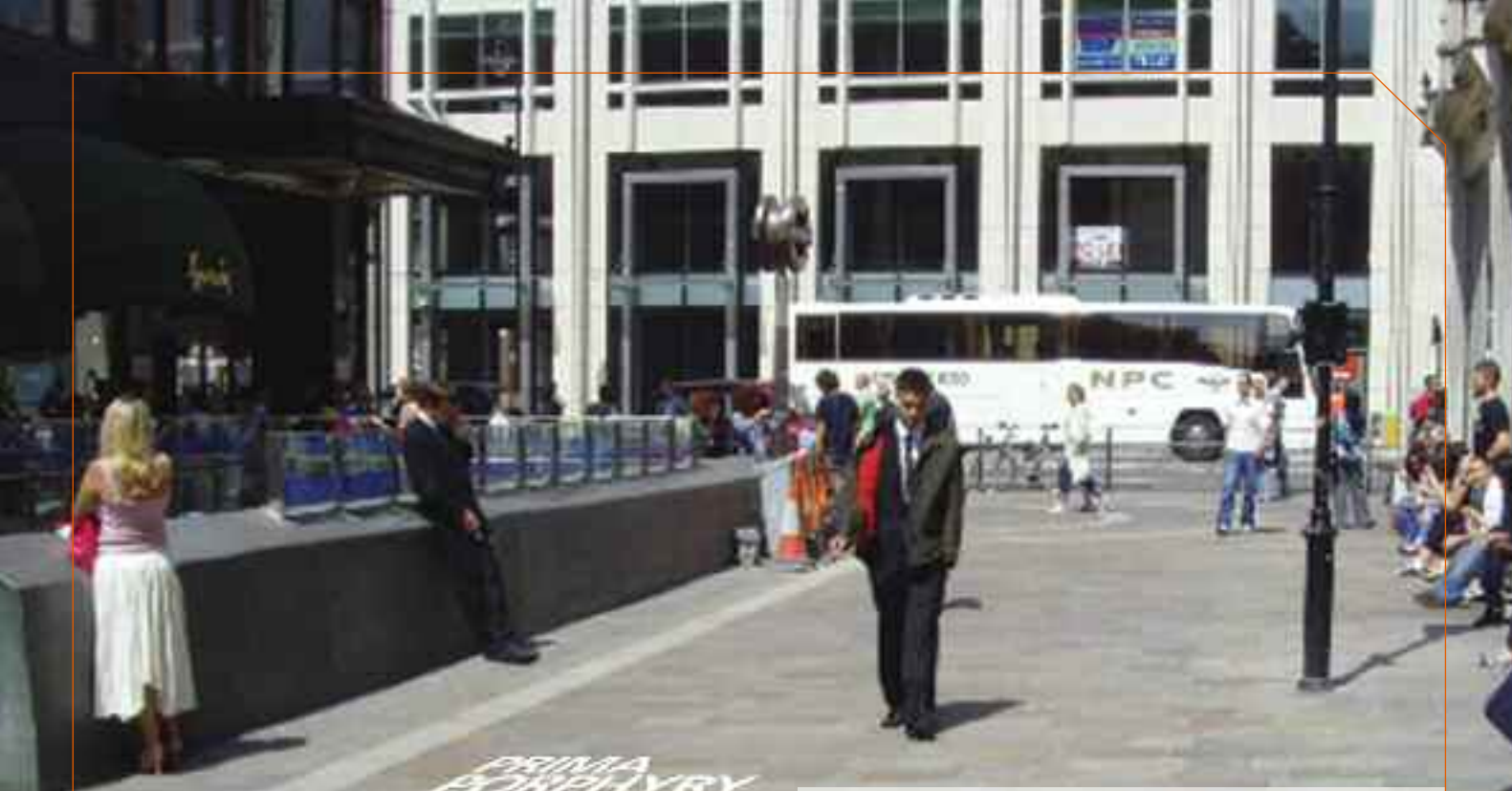
Hans Crescent, London Violet Mix