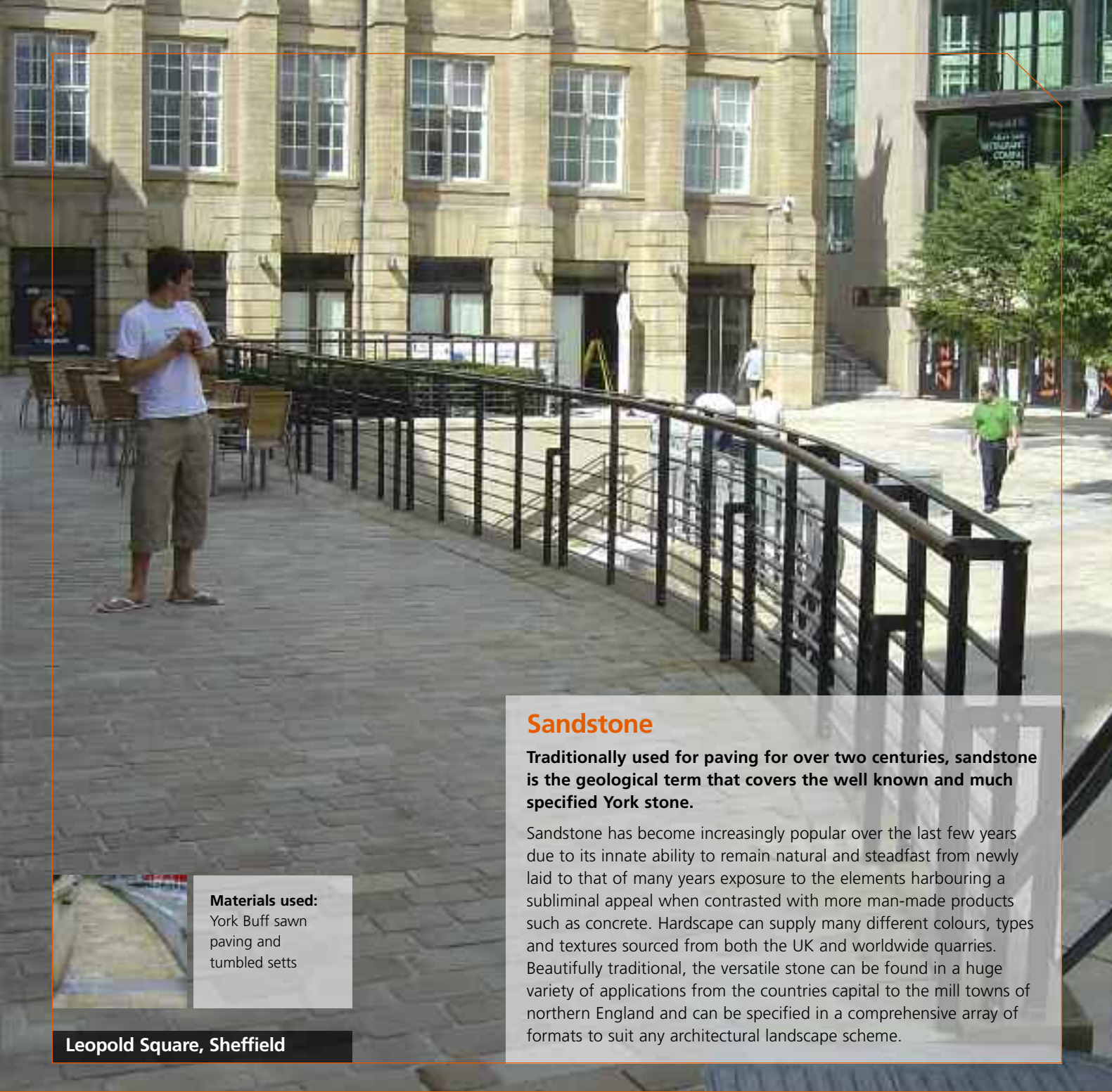
Leopold Square, Sheffield

Materials used: York Buff paving and tumbled setts