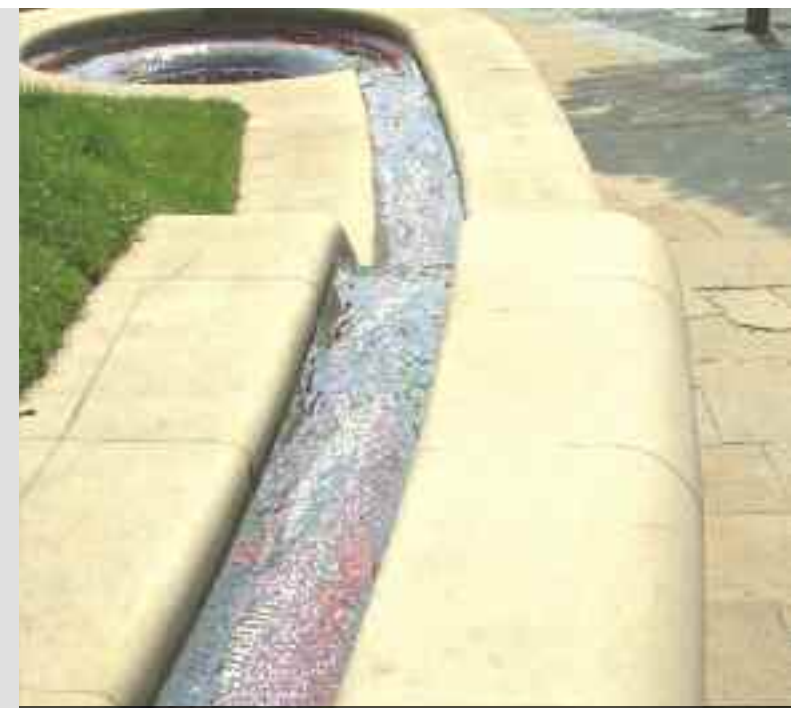
Howard Street, Sheffield