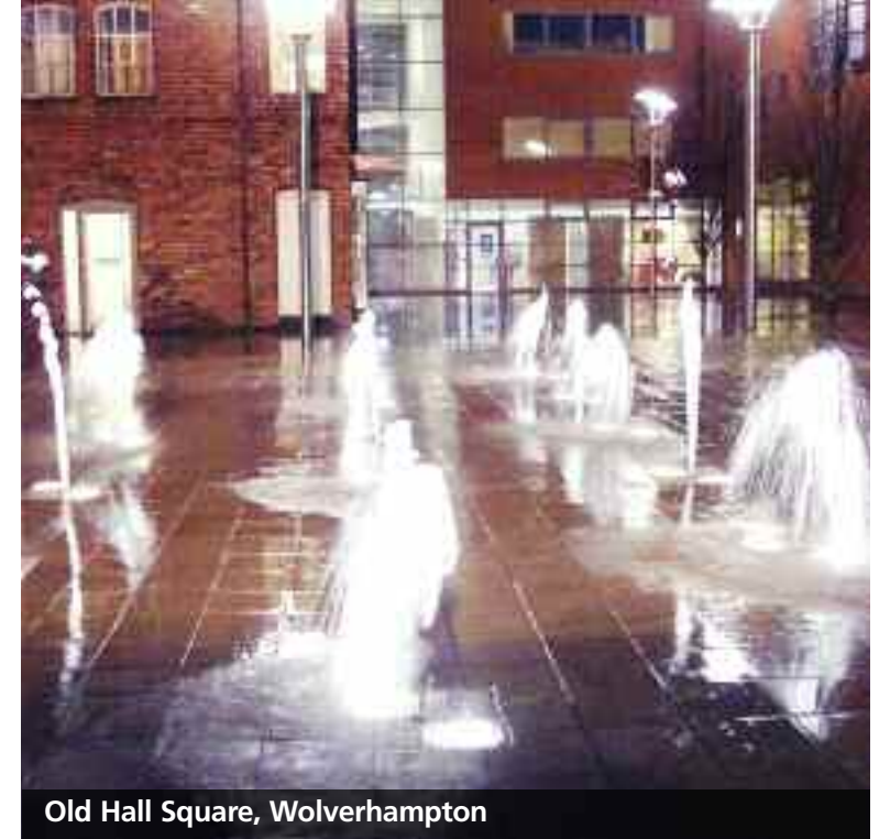
Old Hall Square, Wolverhampton

Usually paved vertically, kerbstones can be used for shaping footpaths, flower-beds, stairs or for marking edges of traffic and pedestrian paved areas.