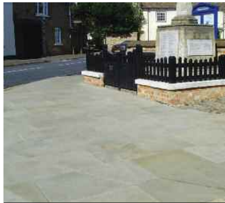
High Street, Kimbolton