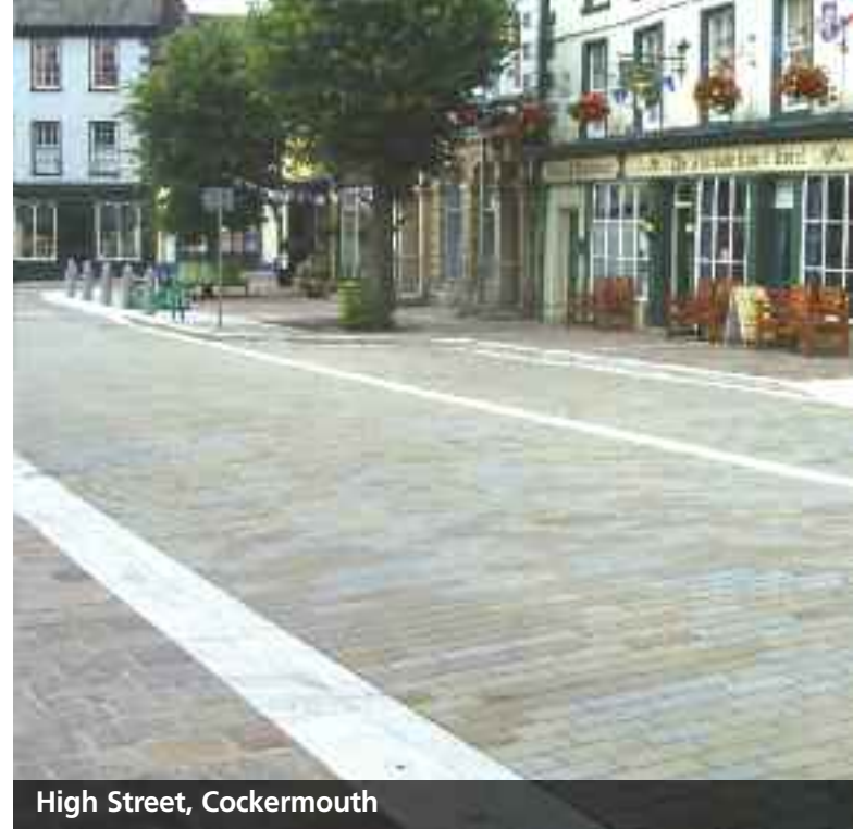
High Street, Cockermouth